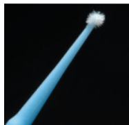
• Straight position.

Multi-Brush Original Blue is ideal for cavity liners, bonding agents, etchants, disclosing solutions and haemostatic. For acetone based solutions, use Multi-Brush Multi-Colors or Magic-Brush. Applicators are packaged in a tamper free, shrink wrapped box for ultimate hygienic control.