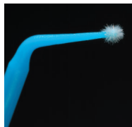
• Short bend position.