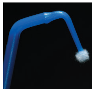
• Double bend position.