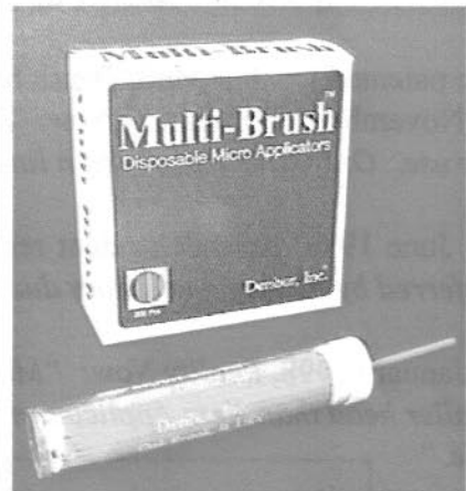
Above: Multi-Brush and Dispenser

We'd like to hear from you! Please drop us a line if you'd like to share any thoughts, ideas, or challenges you face in to profession. Please send correspondence to: